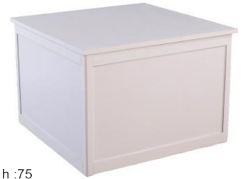
SERĐİ KÜPÜ DISPLAY CUPE