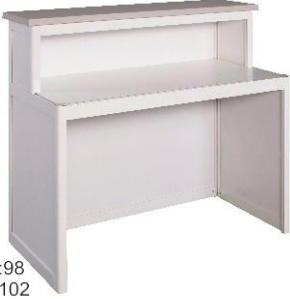
BANKO INFORMATION DESK