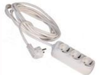
UZATMA KABLOSU EXTENSION CORD