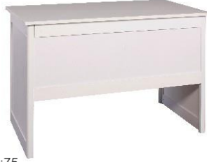
SİSTEM MASA SYSTEM TABLE