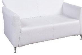
ÇİFT KİŞİLİK KOLTUK SOFA