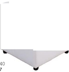
DERİ PUF LEATHER POUFFE