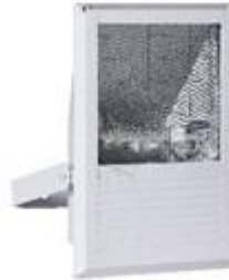
METAL HALİDE HCL