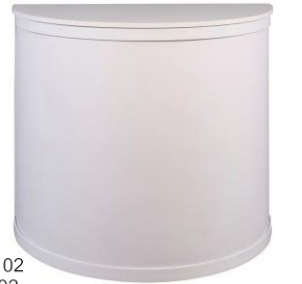
KÜÇÜK OVAL BANKO BIG OVAL DESK