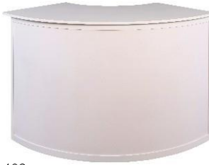
BÜYÜK OVAL BANKO BIG OVAL DESK