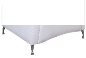
TEK KİŞİLİK KOLTUK ARM CHAIR