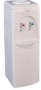
SU MAKİNASI WATER FOUNTAIN