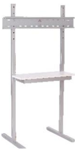
PLAZMA DEMİRİ PLASMA STEEL