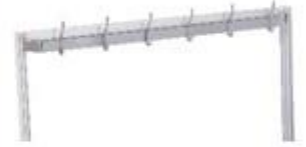
SİSTEM ASKILIK COAT SYSTEM