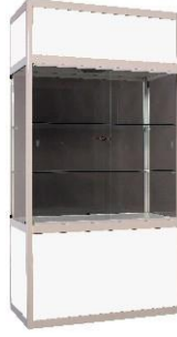
İŞIKLI VİTRİN SHOWCASE LIGHT