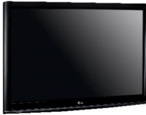
PLAZMA TV42" PLASMA TV42"