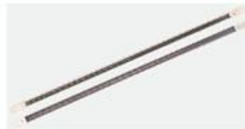
ELEKTRO RAY ELECTRICAL RALL