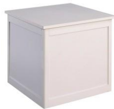
SERĐİ KÜPÜ DISPLAY CUPE