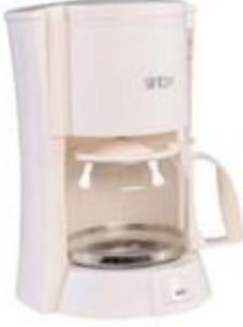
KAHVE MAKİNASI COFFEE MACHINE