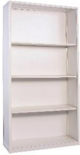
RAFLI DOLAP CUPBOARD SHELF