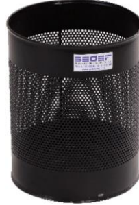
ÇÖPKOVAŞI WASTE PAPER BASKET